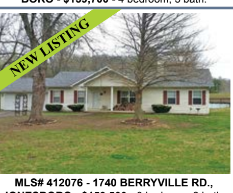
JONESBORO - $153,500 - 3 bedroom, 2 bath.