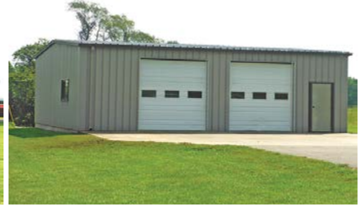
BRICK RANCH ON 5 ACRES! This home has it all! Full basement, mostly finished, 3 baths, fireplace, asphalt drive, 16x32 pool, and commercial steel 40'x40' shop with heat and a/c! Anna Schools here! $239,900! Call now!

CHOOSE THE BEST! HIRE ONE OF OUR EXPERIENCED BROKERS TODAY!3