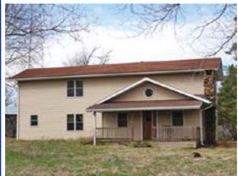
COME ENJOY THIS COUNTRY HOME - just 2 miles from Anna and 8 miles to I-57. Great views of the pasture and wildlife in this 3 bedroom and 2 bathroom home. Over 7 acres with a pond and pasture. $149,000