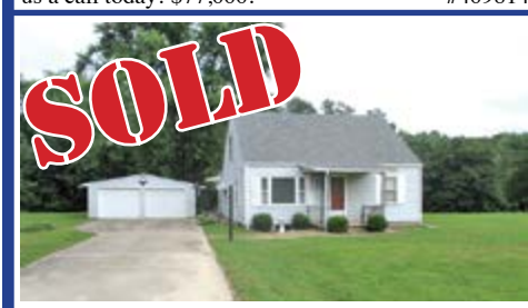
ANNA - 4 bedroom, 1 bath, detached 2 car garage, large vard, $59,000.

JONESBORO - CUTE, CUTE, CUTE!! You've got to see this 2 bedroom, 1 bath home! This home has newer flooring, bathroom, furnace & windows. There's also a basement and detached garage. Give us a call today! $77,000.