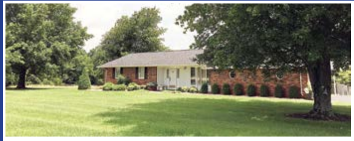
IMMACULATE BRICK HOME on 1.5 ACRES! Here is a special property superbly kept, well constructed, nice basement, and more! Nice horse property with addition of barn. $185,000!