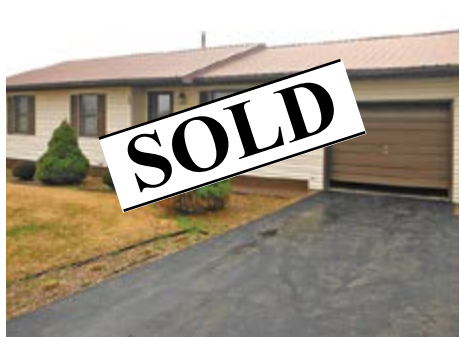
LIKE NEW! GREAT PRICE! This 3 bedroom home has almost 1 ac. lot, asphalt drives, 4 car garage parking and more! Asking $87,500!