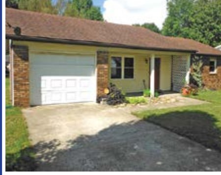
it little over 2 years ago! Sound basement, on! Good looking ranch with 3 bedrooms, large garage, dual c/air units and all new fence back yard, garage, c/air, and more! Only $64,900!