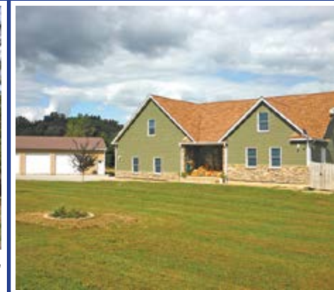
SUPERIOR HOME and 12 acres! This home has i all: 5 bedrooms, shop, pool, lake, location, Marion