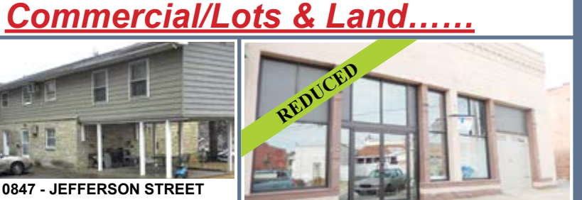
MLS# 404798 - LAYFAETTE - $55,000 - Your chance to own your own business!