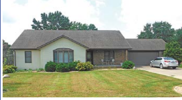
EXCELLENT OPPORTUNITY for a great family home in choice Anna location! This find ranch home has 2320' of living area, 4 bedrooms, 2 baths, NEW appliances, large 2 car garage and 1 large detached outbuilding, fenced rear yard