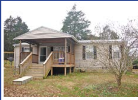
JUST OFF LICK CREEK ROAD - Anna Schools! We offer this sectional home on 1.5+/- acres on Campground School Road! This 3 of Wildlife, and a running creek in a secludbedroom, 2 bath home is all electric and has nice covered front porch, central air and large storage shed. $87.500. See Today!