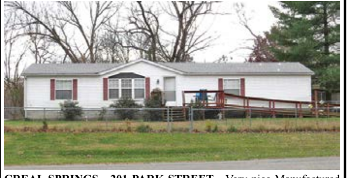
Home on 3 lots next to the Creal Springs Park. Nice size 3 Bedrooms large lot was remodeled in 2015. New roof, windows, siding, doors, carwith a large Master Bath. Large Kitchen with an Island. This property is pet, cabinets, drywall, and HVAC. Owners have added a mobile Island also equipped with a Generator so if the power goes out, your lights stay in the kitchen, Granite counter tops, lovely back splash, extra cabinets, on. Offered at $69,900.