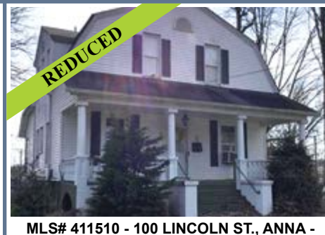
$92,000 - 4 Bedroom, 2 Bath