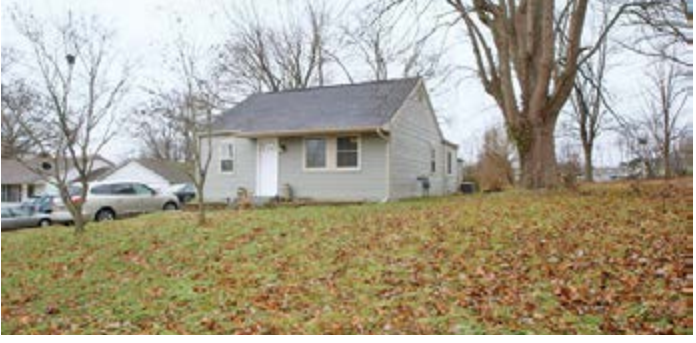
CREAL SPRINGS - 201 PARK STREET - Very nice Manufactured GOREVILLE - 309 W. COLLINS - This 3 bedroom 2 bath home on a #410130 mirrors, and appliances. Offered at $129,000.