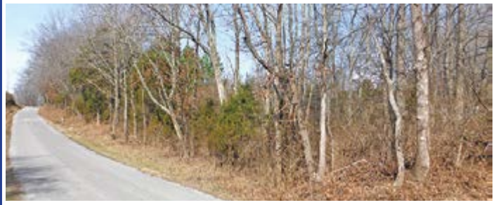
14 SURVEYED ACRES - ANNA SCHOOLS! This land parcel is most wooded and has 325' blacktop frontage and electric. Great place for that rustic home you have always wanted! Broker owned - $52,500.