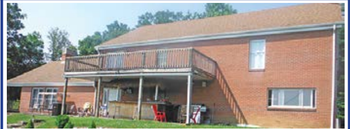
STATELY BRICK HOME ON 5 ACRES! Here is the closest thing to a ledge design we offer! Lots of woodwork! High ceilings, full basement walk-out, 2 fire-places, 2 car garage, great views, pool, decks and more! REDUCED TO $199,900 for the 1st TIME! Jonesboro School District!