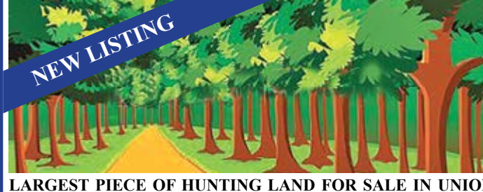
COUNTY! 154 acres on State Forest Rd. bordered on two sides by Shawnee National Forest. Also has a 3 bedroom, 1 bath home that's less than 10 yrs. old. All this for $379,900!!!