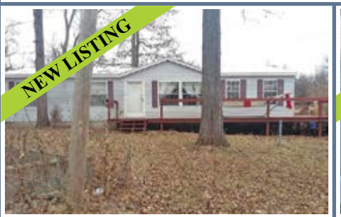
home on 11 acres, 1 mile from Lake of Egypt.