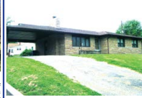
NICE CUSTOM STONE RANCH or beautiful corner lot with 3 bedrooms, full poured basement, all electric, and fire-