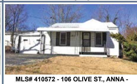
$39,500 - 3 bedroom, 1 bath.