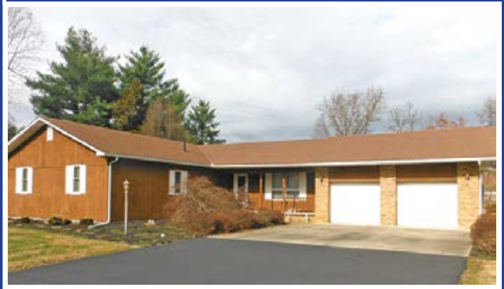
JUST LISTED! 2100' ranch just minutes from Carbondale! Pool. 2 car attached garage and detached, fireplace, nice 1 acre lot, county blacktop, all electric, asphalt drives and more! This home is NICE! $173,000