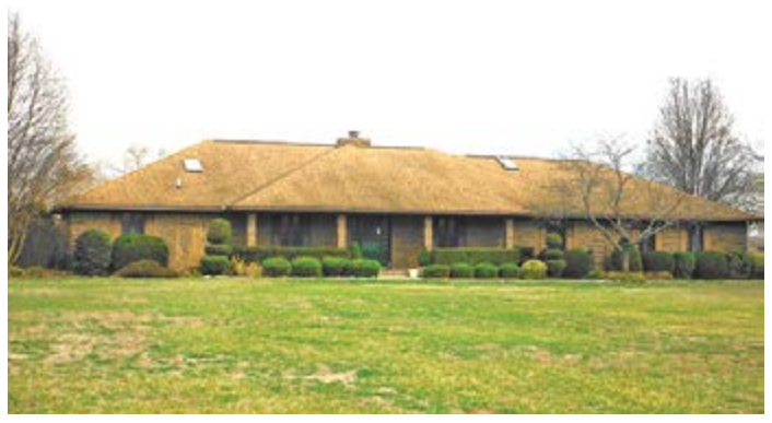
3,600' BRICK RANCH ON 20 ACRES! Magnificent 4 bedroom home with fireplace, geo thermal heat, custom kitchen, large rooms, and more! Large shop building with office and stalls! Property could be divided! $365,000.