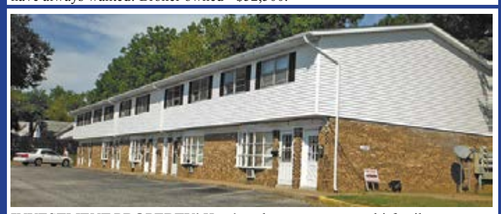
INVESTMENT PROPERTY! Here's a chance to own a multi-family apartment complex in Anna! $70,000/yr. income potential! Owner just spent approximately