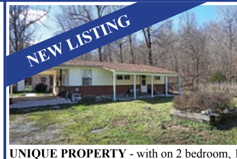
oath home completely remodeled in 2000, one 1 bedroom, 1 bath and a large studio cabin on ed country setting is what you are looking for then stop looking you just found it for only