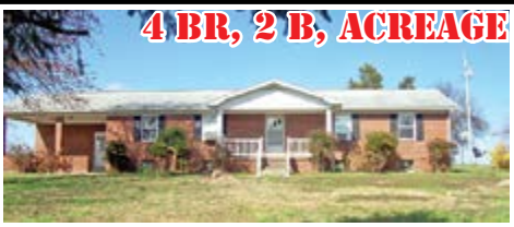
4 BR, 2 B, ACREAGE

302 CANTERBURY CT, MAYFIELD - Immediate Possession - 4 br, 4.5 bath, brick, on corner lot near golf course, master suite main level, abundance of stg, granite counter tops, beautiful wood flooring, FP in family room, formal LR & dining, lots more. Priced @ $258,500 . Call Glinda 270-705-7212. #91097