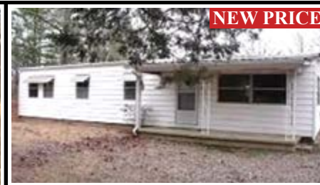
820 RIDGE ROAD NEW PRICE Located in the Lake Area, this older mobile home features 3 bedrooms and 2 baths on approx. .5 acre and is in need of some TLC. Call Melody Burgess. $11,900. #90517