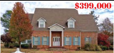
$399,000 1549 BELLEMEADE DRIVE - SPACIOUS ~ BEAUTIFUL ~ UPDATED in a GREAT neighborhood 5+ BR, 3 full B, Home Theater/Dance Studio/Bonus Room, dining, office, breakfast area, IN-GROUND POOL, vaulted ceilings, many walk-in closets, double lot and many more custom features! *13 Month Home Warranty * $399,000. #89866