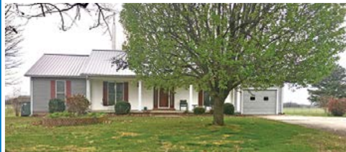
631 TWIN HILL RD

Move in ready 3 bedroom 2 bath with 1 car attached garage and a detached garage/workshop. Sits on a 1.61 acre lot. $127,700.