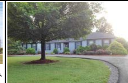
471 STATE ROUTE 2205

Beautiful 4 bedroom 3.5 bath home on 9+ acres. This home features a large master suite, a large bedroom and full bath upstairs that could be a second master or guestroom. Has a stocked pond in front, 1 attached and 2 detached garages outside (24x30 & 30x40) giving you plenty of storage room! Also has efficient geothermal central heat and air! Underground electric, and electric set-up for hooking a generator to your home's electric box, Propane tank is owned and used for gas log fireplace and dryer. Call Richard Chapman. $299,500. #90611