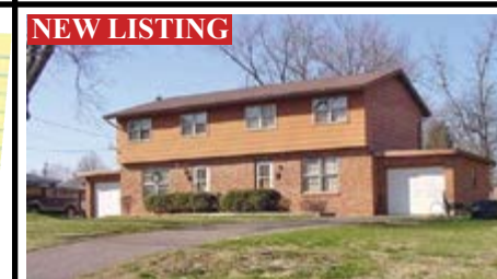
1219 W. BROADWAY NEW LISTING Well Kept Brick Investment property! Each side has 3 bedrooms, 1.5 bath, approx. 1,130 sq. ft. and a single garage. Good income with long term tenants. Call Bob Sparks. $115,000. #91793