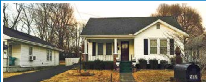
503 W LOCHRIDGE ST.

Very convenient location near purchase parkway ramp. 3 bedroom 2 bath, large carport, lots of storage, split bedroom floor plan. Beautiful hardwood floors, lots of updates. Sellers are very negotiable, asking $99,900 Text 270.705.1299 to see. #90657