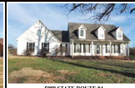
5089 STATE ROUTE 94

New Construction and exquisitely customized home that has quality inside and out. This gorgeous home has 4/5 bedrooms, 2.5 baths, living room with tall ceilings and fireplace, study/library, home theatre, man cave, and much more. Outside you will find a covered front porch, deck off the back, 3 car attached and 3 car detached garage, and paved driveway all on 5.19 acres. Interior is not yet complete, buyer could add own touches to finishes, making this the perfect home for you! $699,900. Call Justin. #90364