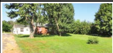
1553 N STATE ROUTE 45 Great location on Hwy 45 North! Commercial property w a 30 x 48 Mechanics Garage with 2 Overhead doors, concrete floors, Water & Heat. Also included with the property is a Brick 1571 sq ft , 3 Bedroom, 1 bath home. All on 3.3 +/- acres. $115,000. Call Richard. #88696