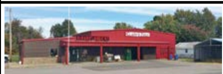
1104 PADUCAH RD PREMIUM COMMERCIAL PROPERTY LOCATED ON 2 M/L ACRES - Versatile metal & stone building having 7,500+ sq. ft. There are 2 o.h. doors, a loading dock, 4 HVAC units, & paved parking. Super adequacy improvements were completed just 3 yrs ago. There is a fireplace, executive office, kitchen, ADA approved baths, and storage. This building would be ideal for retail, commercial, office, warehouse, or manufacturing. $399,000. #85748