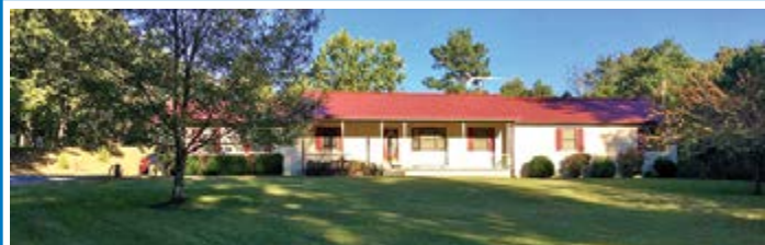
7275 JACKSON SCHOOL ROAD

2 bed, 1 bath with 1 car detached garage on a nice lot that adjoins mayfield middle school. Call/Text 270.705.1299 for details. Needs some updates but priced right at $29k. #88024