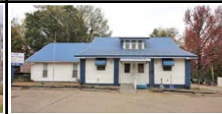
1023 WEST BROADWAY Business Opportunity! This property is a former daycare, in a great high traffic area making it a great location for your next business venture. Building is located in the B-1 Zone and the lot is 90x200. Call Richard. $100,000. #89463