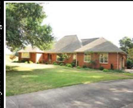
1300 DOGWOOD DRIVE

Gorgeous brick home with 3BR (master down) and 2.5 baths. You will be wowed throughout with a 2 level foyer, living room w/f.place, dining room, an amazing gourmet kitchen w/island, custom cabinets, granite counter tops, charming bkfst area, & an office. The LR opens out to a well designed covered porch overlooking the lake all sitting on 6.7 ACRES!! $349,000. Call Justin. #90303