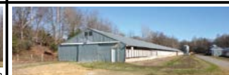
278 FLOYD ORCHARD Income producing property! Older broiler barns in great shape that will require some updates. There is a 4 inch well on the property and many items are to stay; four propane tanks, a tractor, a crusher, a 24x40 building, diesel generator (100KBA), a 12x12 wash shed, and all exterior gates. Located on 4+/- acres in the south part of the county. Call Richard Chapman. $225,000. #91034