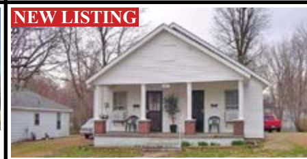
1222 RIDGEWAY NEW LISTING Investment Property. Older duplex but owner has kept it in good condition with many repairs including water heater, metal roof, breaker box, etc. Good location for rental property. Call Bob Sparks. $40,000. #91811