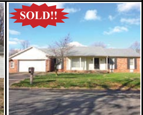
125 CAMPBELL COURT #90689