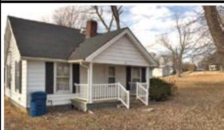
111 OLD MACEDONIA CHURCH ST. Located near town, this home has 2 bedrooms, 1 bath, ample size kitchen, covered back and front porches and a nice size outbuilding, all situated on a spacious lot. $18,000. Call Justin. #89900