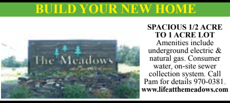
BUILD YOUR NEW HOME

PRETTY 3 BEDROOM, 2 BATH HOME - located in Haymarket Corner, has a split floor plan, c/gh/a, newer shingles and 2 car attached garage. Call Debbie for your showing (270) 705-6161. Priced at $139,900 . #86985