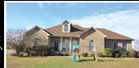
1439 TWIN HILL ROAD

Very rustic hideaway in the North part of the county. Built in 2010, this home is in great condition and features 2 bedrooms and 2 bathrooms, a large living room with a gas log fireplace, and an upstairs loft. Kitchen appliances stay and there is a nice fishing pond and stock barn on the property. This home is sitting on 35 level acres suited for crop farming, cattle, or horses. Call Richard Chapman. $269,900. #91189