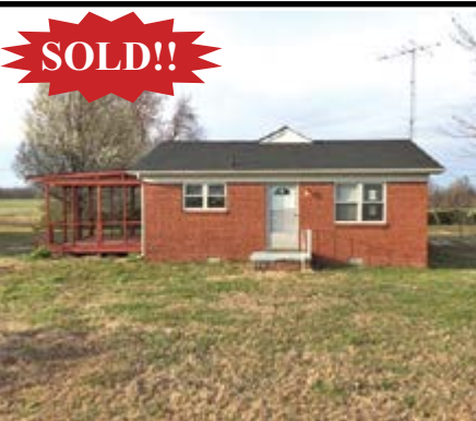
4984 W. ST. RT. 94 #91081