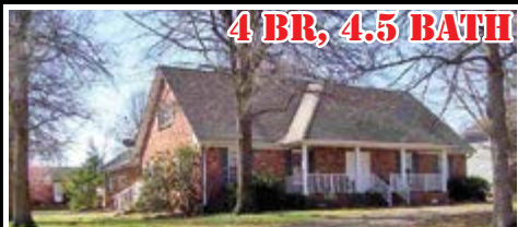
4 BR, 4.5 BATH

302 CANTERBURY CT, MAYFIELD - Immediate Possession - 4 br, 4.5 bath, brick, on corner lot near golf course, master suite main level, abundance of stg, granite counter tops, beautiful wood flooring, FP in family room, formal LR & dining, lots more. Priced @ $258,500 . Call Glinda 270-705-7212. #91097