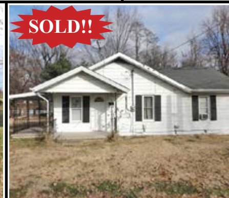
1233 RIDGEWAY ST. #90038