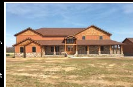
774 STATE ROUTE 2192

6th & Walnut, Mayfield, KY Mon. - Fri. 8:30 a.m. - 5 p.m.; Saturday - 9 a.m. - 12 (Noon) (any time by appointment) Call today to schedule an appointment: (270) 247-2421 Fax: (270) 247-2772 Email: office@barger-realty.com