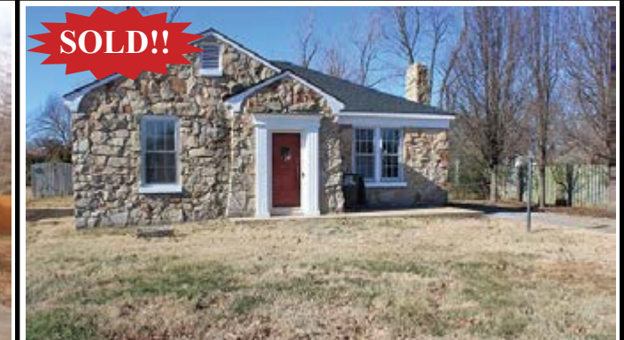
1205 WILFORD ST. #90164