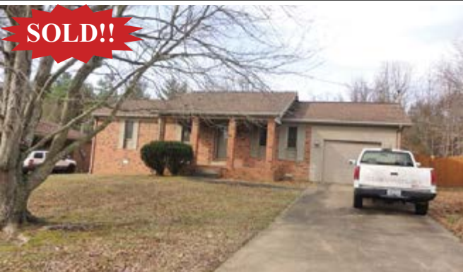
1021 WEDA CIRCLE #90459