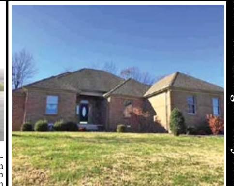
113 ARBOR COURT

Spacious and open brick home in perfect condition! Features 4 bedrooms, 3.5 bath, large kitchen with abundant storage space, large family room with a wet bar. On the exterior there is a lovely screened in porch with a large deck attached, 2 car attached garage, detached enclosed workshop, and a brick building that can be converted to your liking. This home truly has everything and more all located in the Farmington School District!! $269,500. Call Richard #89963