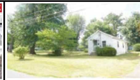
951 DOWDY STREET 3 LOTS AND INVESTMENT PROPERTY. Great space for investor to build additional properties. Don't miss this opportunity - 3 lots and small house for only $27,500. Call Nancy Carol.