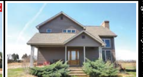
6721 HOPEWELL ROAD

Custom built with quality and amenities throughout. Approx. 4660 sq. ft. features 4 bedroom 3.5 bath large gourmet kitchen with open concept to living room. Extras include surround sound, security system, projector systems, and a home generator. All of this sits on 3 acres with 40x60 detached building with lean to. $289,000. Call Debbie or Richard. #90228