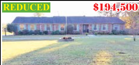
REDUCED $194,500 3829 STATE ROUTE 121 S. - Beautiful brick home, close to town. 3 large bedrooms, 2 baths and formal dining. Living room has beautiful mantel with electric logs. Kitchen, breakfast and family room is all open & has wood burning fireplace. Covered brick porch and attached garage. Call Debbie @ 705.6161 to see this lovely home. Priced @ $194,500. #89554