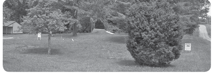
CAMPERS LANE PHAROAHS GARDENS - Two great lots at Lake of Egypt. All utilities on property plus storm shelter. Plenty of room and in a quiet rural setting. Located just 3 blocks from subdivision boat ramp. $28,000. #326538