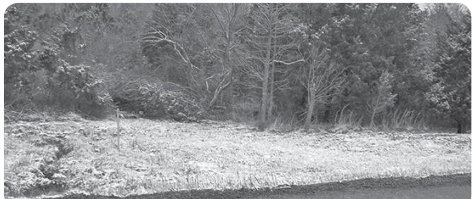
LAKE OF EGYPT, EAGLE POINT BAY - Two great building lots with easy access for a home, mobile, or commercial structure. $9,000. #325359