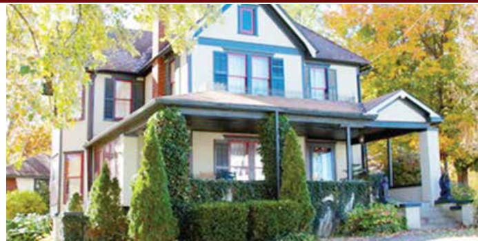
125 Chestnut St, Alto Pass • #329989 • $109,900

Quality in the Country! Five acres in rural Johnson County, just minutes from interstate 24. 2 Story energy efficient brick home with 3 bedrooms and 2.5 baths. Beautifully landscaped yard, pond, lofted out-building, kids play place and 3 patios all add to the exterior charm of the home. Other amenities include central vac system, wood burning fireplace, pantry and storage space throughout. New HVAC INSTALLED in 2007, new windows on East, South and West sides. Large gorgeous sunroom with pond views leads out to rock patio. Deep dry basement with built in shelving, potential to be converted into fourth bedroom, rec. room, etc. Formal Dining and Family room. Turkey, deer, and fox right outside. Enjoy the peace and quiet in this comfortable home.