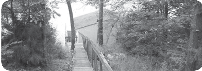
GOREVILLE - Build your dream home on the lot while you enjoy the great water front views or fishing from the boathouse. The waterfront is limited, but the water is deep. #329151