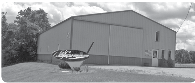
VIENNA - Rt. 45 north of Vienna sitting on 1/2 acre of ground, pole barn commercial building with 3500 square feet, 14 ft. ceilings, 1 overhead door, and an office with 1 bathroom. Good location and the possibility that more acreage would be available for purchase. $75,000. #329154