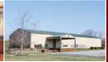
813 N. Main St. Anna • #315696 • $395,000

This 24.5 Acres of paradise is amazing. With mixed agricultural and residential zoning, a large 2+ acre pond, a 49x96 pole barn, a beautiful 1800 Sq. ft home, and all the privacy you could desire. The home has beautiful vaulted ceilings, and an open kitchen, dining, & living area. Beautiful cabinetry and countertops in the kitchen and bathrooms are exquisite, and the house is in beautifully kept condition. It is a must see. The 49 X 96 Pole Barn has a Large work shop area. This property may be subdivided with City specifications.